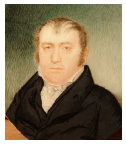
Col. Ephraim Stone

This information is from The Story of Templeton.