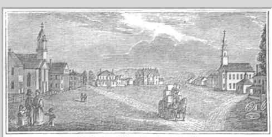
North view of Templeton, (central part.)

Next meeting March 1, 2023 at the Senior Center 7pm