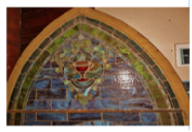
Top of the Church Window

Opening the Grand Drape will reveal the Advertising curtain with many of the local businesses of the time, also painted by mister Tandy in 1935, do you recognize any names?